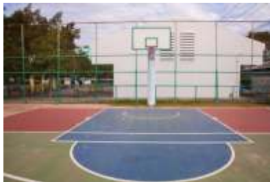
Multi Sports Game Court