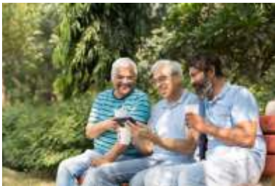
Senior Citizens Area