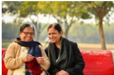
Ladies Discussion Area