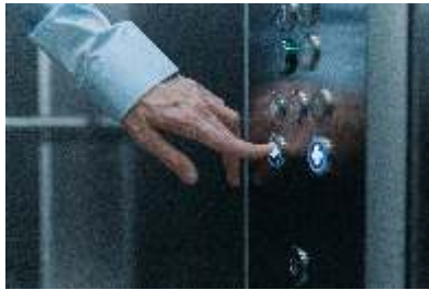
Automatic High-Speed Lift with Generator Power Back-up