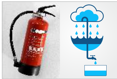
Fire Safety Cylinder