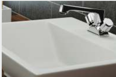
Jaguar ESCCO Fittings