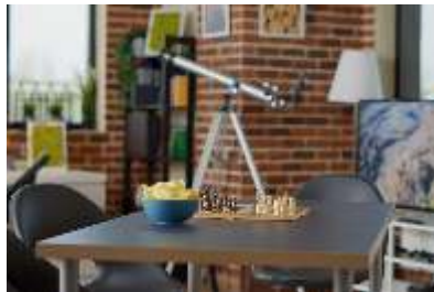
Board Games Room