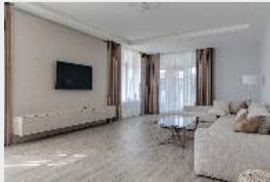
False Ceiling in Hall