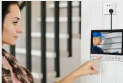
Video Door Camera