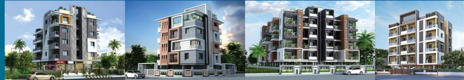
Anupama Pearl Residency Anupama Siddhi Vinayak Anupama Amrapali Phase - I Anupama Jeevan Saathi