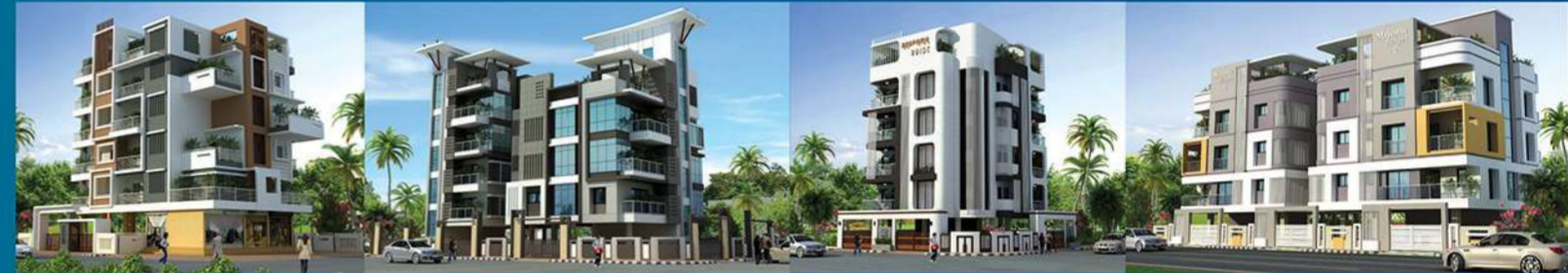
Anupama Deep Mala Anupama Riddhi Siddhi Anupama Pride Anupama Majestic Height I & II