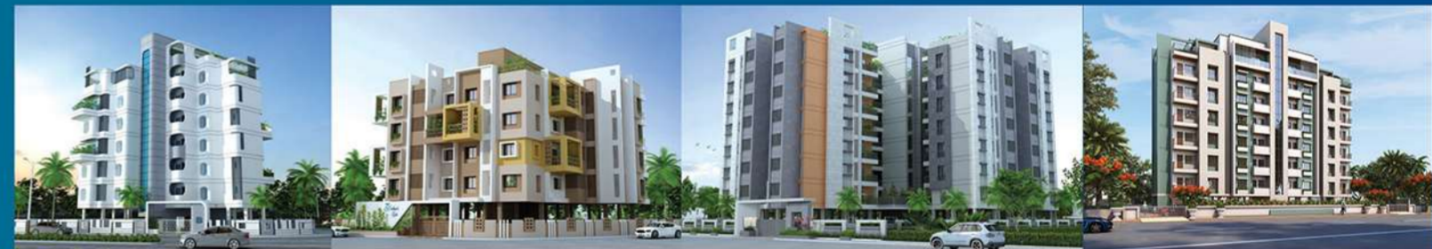
Anupama Amrapali Phase - II Anupama Krishna Leela - I Anupama Krishna Leela - II (On-Going Project) Anupama Varundavan (On-Going Project)