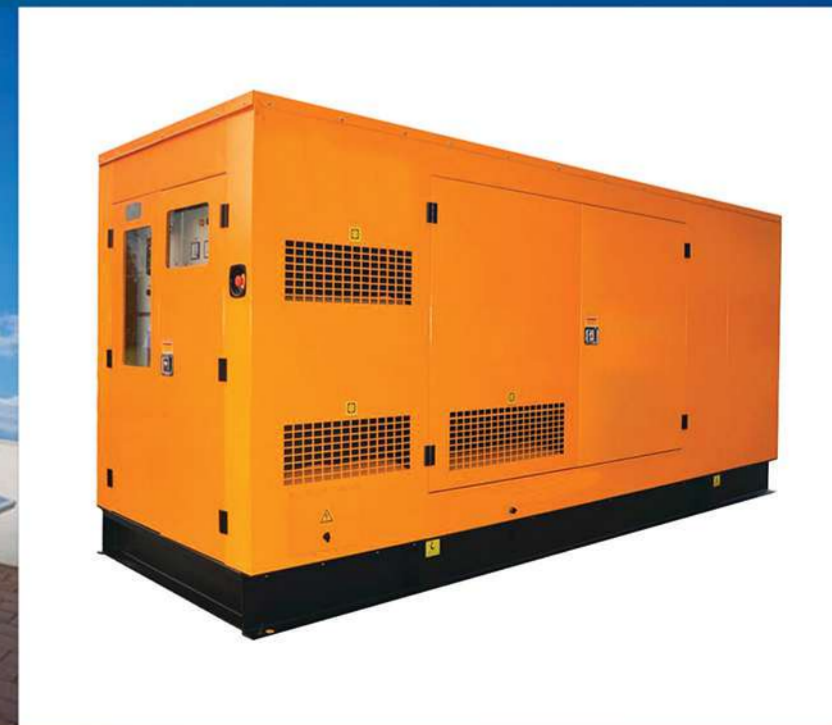
Generator For Common Electricity