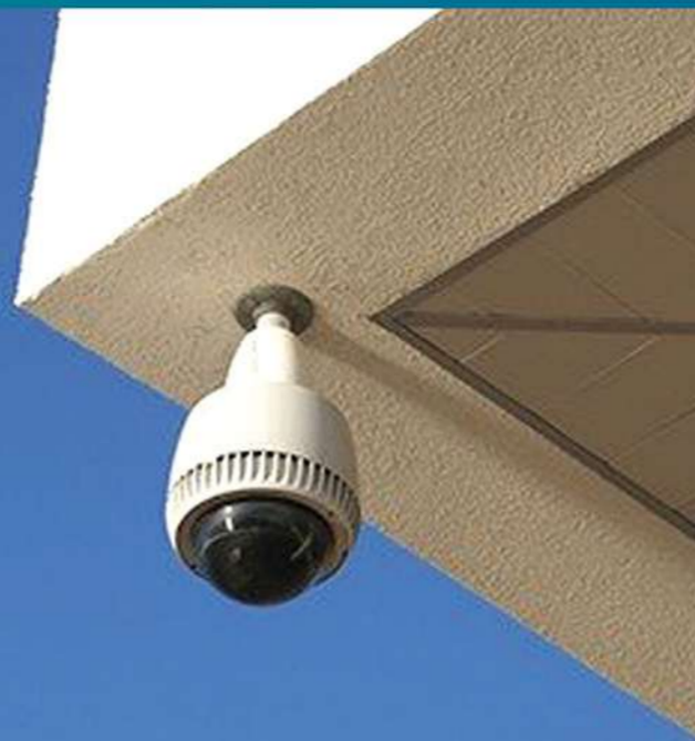
Premises Secure with CCTV