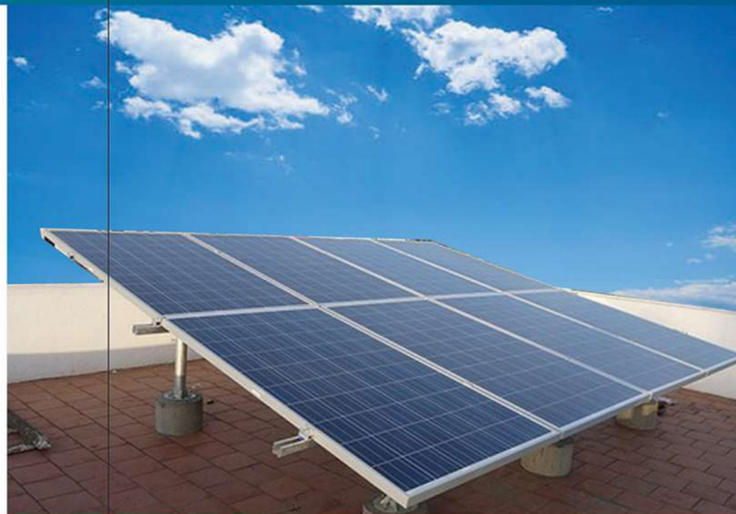
Solar Energy Power