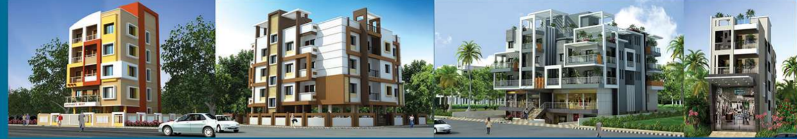
Anupama Meet Anupama Neel Gagan Anupama Mile Stone Anupama Golden Gaallery