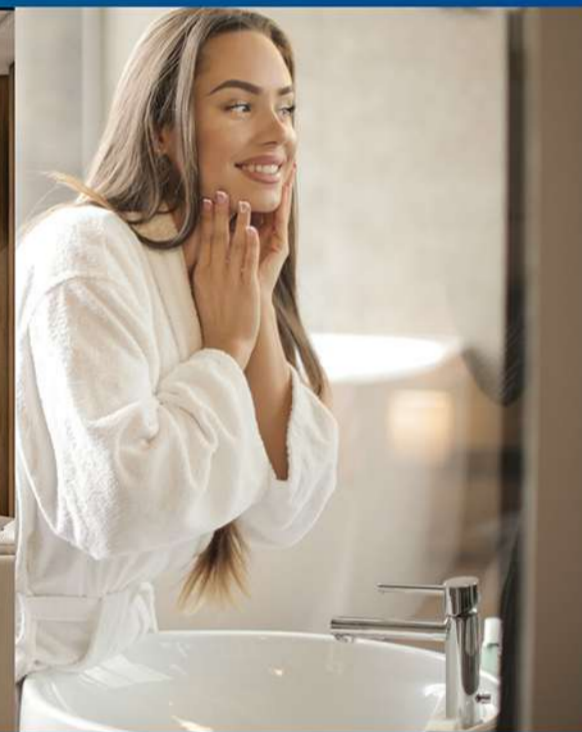
Branded Jaquar Essco Bath Accessories