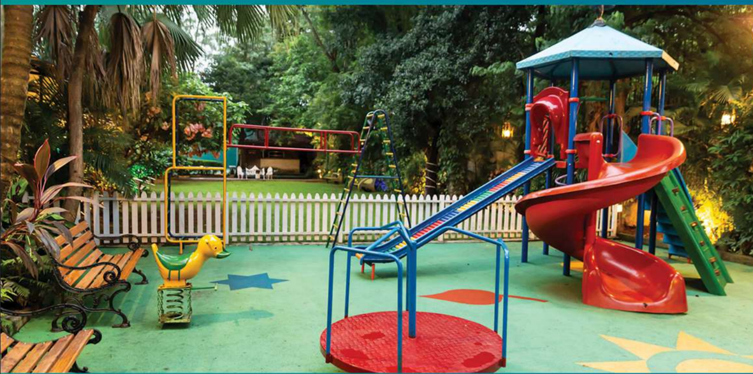
Garden & Children Play Area