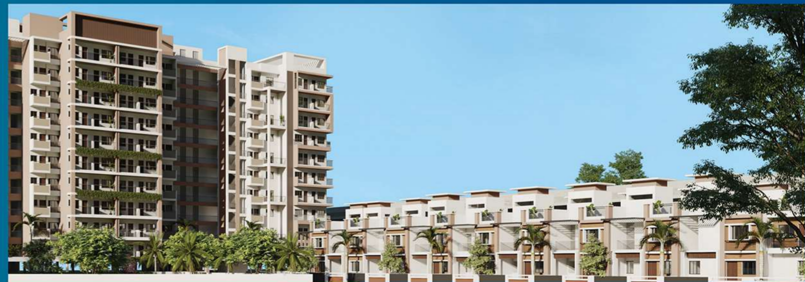
Anupama Silver Valley (On-Going Project)