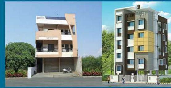
Anupama Anupama Jeevan Chhaya

ANUPAMA KRISHNA LEELA - III — 2 & 3 BHK PREMIUM HOMES —