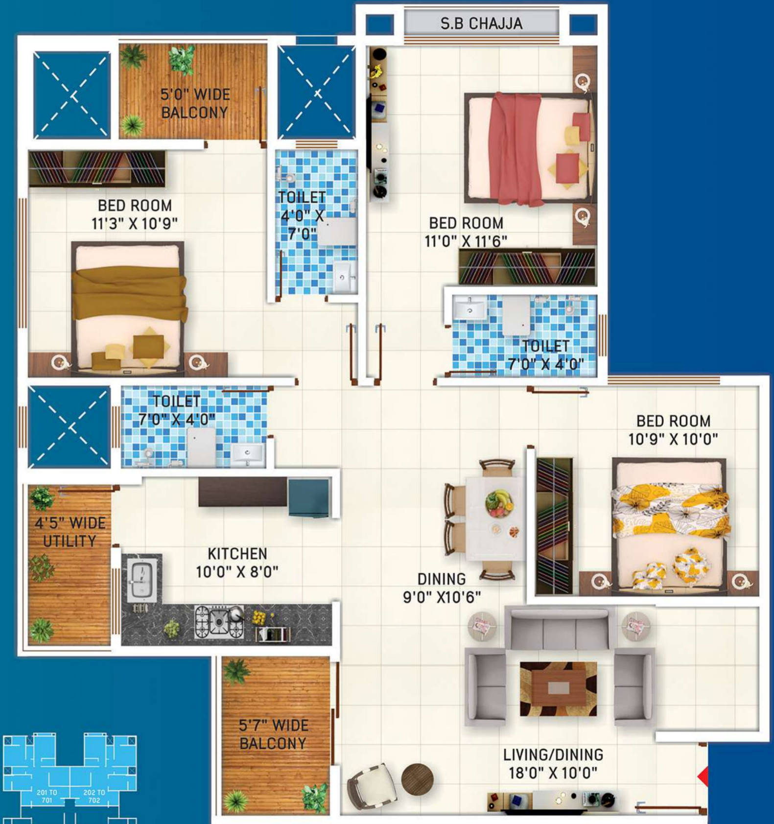
TYPICAL SECOND TO SEVENTH FLOOR [ 201, 202, 206 ]