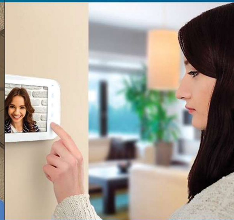
Video Door Camera