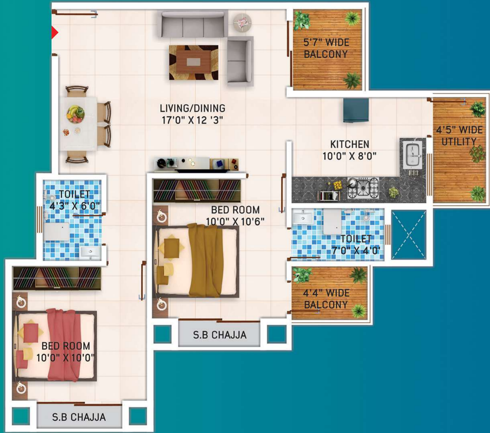
TYPICAL SECOND TO SEVENTH FLOOR [ 205 ]