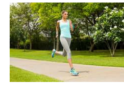
Jogging Track with Lawn