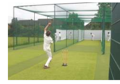
Netted Cricket Pitch