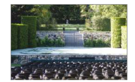
Party / Yoga Deck