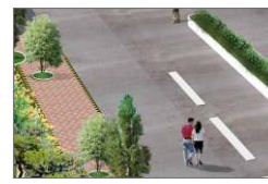
Concrete Roads with paver blocks.