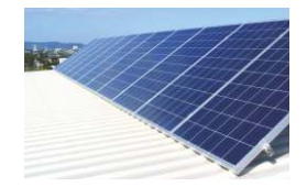
Solar Power Station for all common area