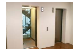
2 Lift in each Building