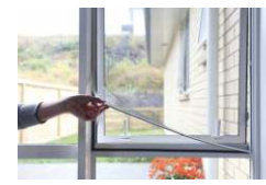
Mosquito Net to all windows

Top Floor flat with heat insulation & extra POP in both bed rooms