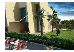
Multipurpose Hall with Lawn