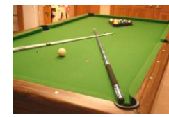
Indoor Games Area (Pool Table)