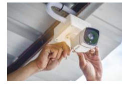
CC TV Surveillance