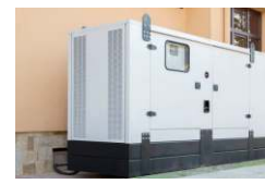
Power Backup for Common Utilities