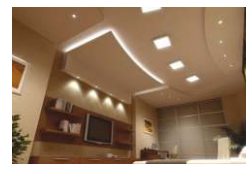
POP in hall with LED lights