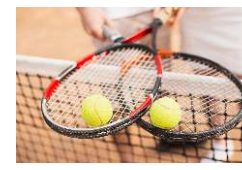
Badminton / Volleyball Court