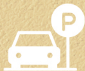
Visitor Car Parking