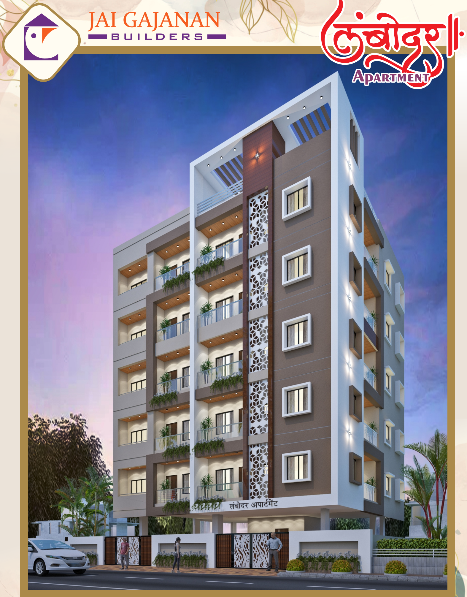
Plot No 81, London Street, Swawlambi Nagar, Bhende Layout Sq., Nagpur-440022.