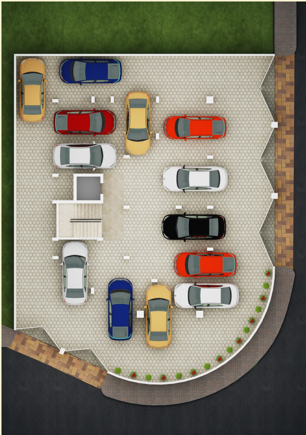
GROUND FLOOR PARKING PLAN