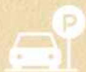
Visitor Car Parking