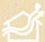
Fully Ventilated Apartments