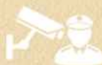
24*7 Security with CCTV Surveillance & Compounded Society