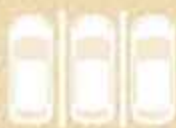
Allotted One Car Parking