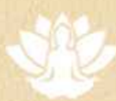
Yoga & Meditation Area