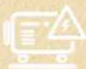
Generator Backup for Common Area Lights +1 Lift