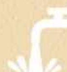
24*7 Water Supply (Corporation & Ground Water)